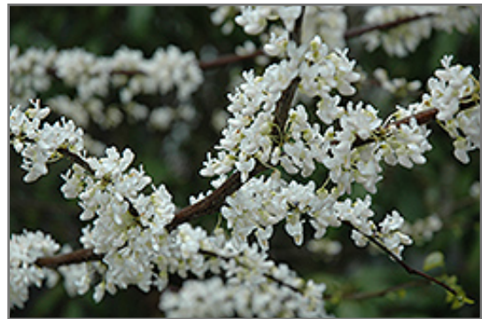
White Redbud flowers