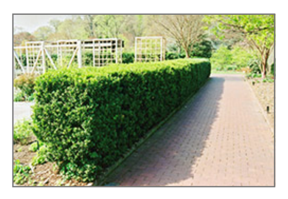
Common Boxwood

8424 Farley St. Overland Park, KS 66212 913.642.6503