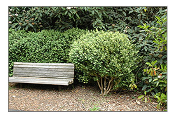
Common Boxwood