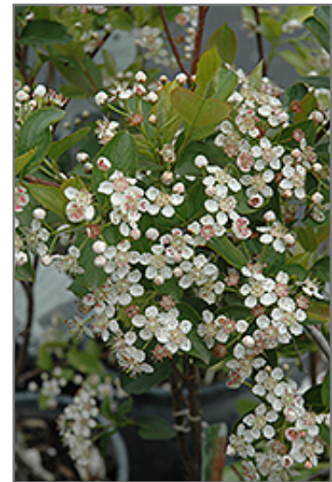
Viking Chokeberry flowers