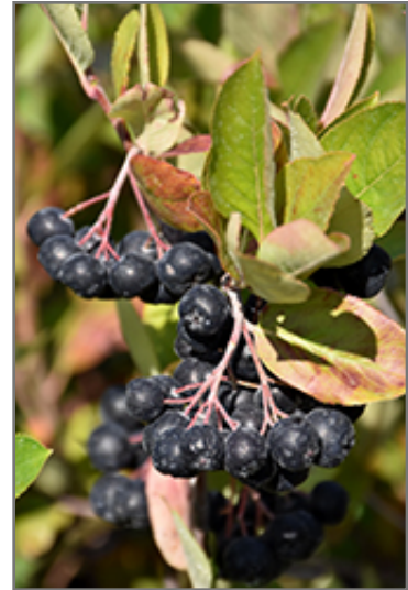
Viking Chokeberry fruit

This shrub should only be grown in full sunlight. It is an amazingly adaptable plant, tolerating both dry conditions and even some standing water. It is not particular as to soil type or pH, and is able to handle environmental salt. It is somewhat tolerant of urban pollution. This particular variety is an interspecific hybrid.