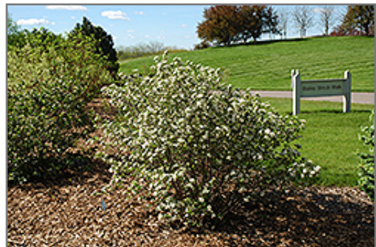
Autumn Magic Black Chokeberry in bloom