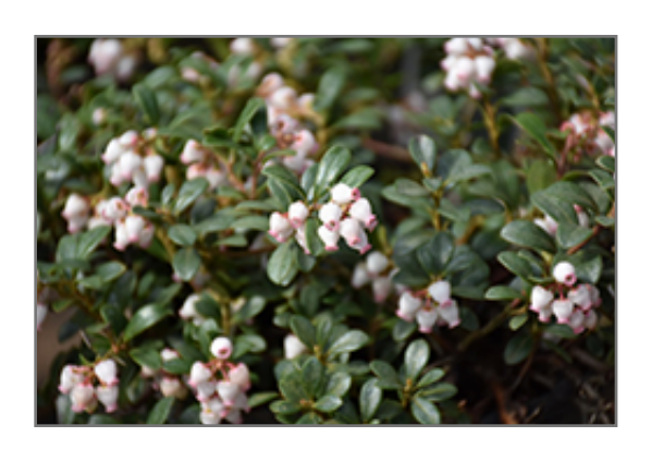
Massachusetts Bearberry flowers