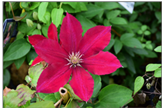
Rebecca Clematis flowers