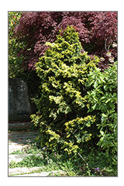
Verdon Dwarf Hinoki Falsecypress