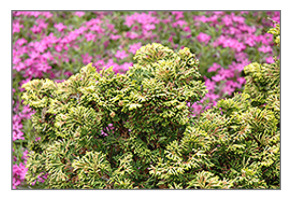
Verdon Dwarf Hinoki Falsecypress foliage

830 W Liberty Dr. Liberty, MO 64068 816.781.0001