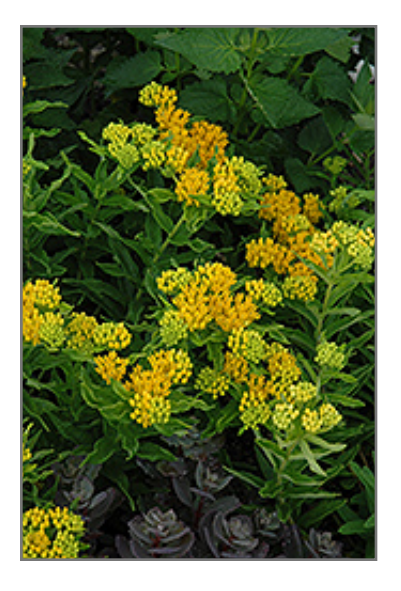
Hello Yellow Milkweed flowers

830 W Liberty Dr. Liberty, MO 64068 816.781.0001