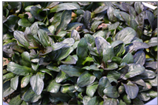
Blueberry Muffin Bugleweed foliage