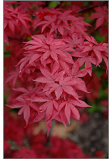
Twombly's Red Sentinel Japanese Maple foliage