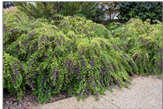
Issai Beautyberry fruit