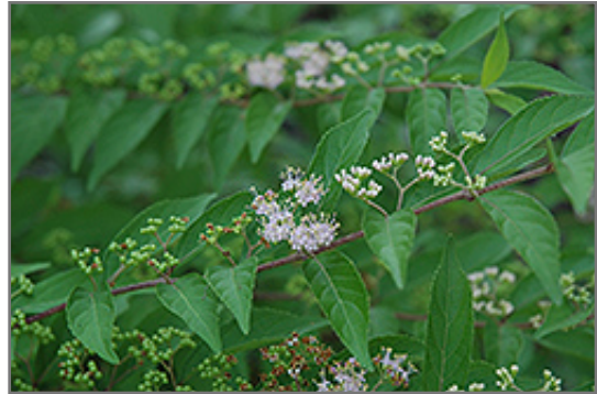
Issai Beautyberry flowers

Issai Beautyberry will grow to be about 4 feet tall at maturity, with a spread of 5 feet. It tends to fill out right to the ground and therefore doesn't necessarily require facer plants in front. It grows at a fast rate, and under ideal conditions can be expected to live for approximately 20 years.