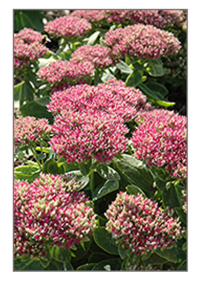
Hot Stuff Stonecrop flowers

830 W Liberty Dr. Liberty, MO 64068 816.781.0001