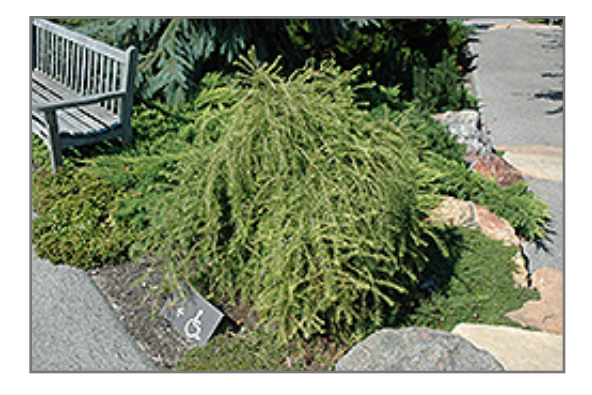
Puli Weeping Larch

Puli Weeping Larch is recommended for the following landscape applications;