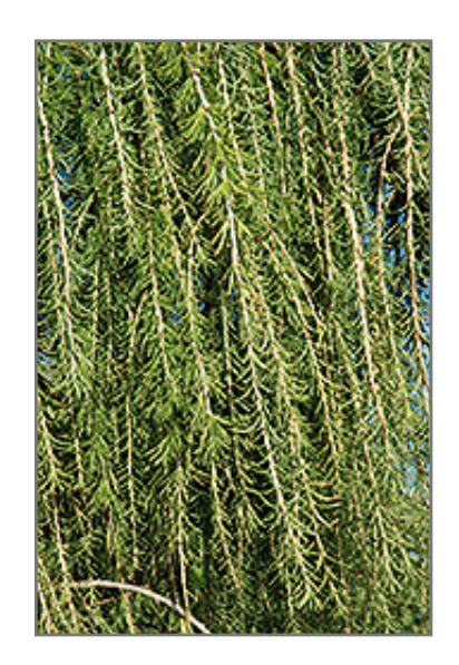
Puli Weeping Larch foliage

8424 Farley St. Overland Park, KS 66212 913.642.6503