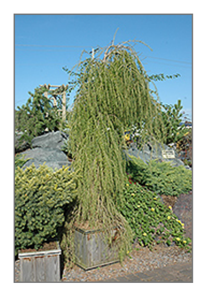
Puli Weeping Larch

This shrub does best in full sun to partial shade. It is quite adaptable, prefering to grow in average to wet conditions, and will even tolerate some standing water. It is not particular as to soil type or pH. It is somewhat tolerant of urban pollution. This is a selected variety of a species not originally from North America.