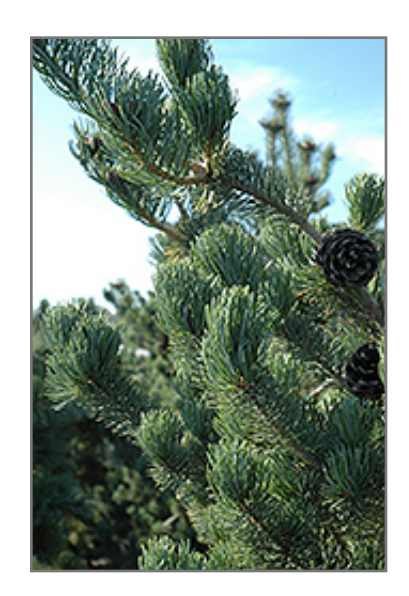
Tempelhof Japanese White Pine foliage