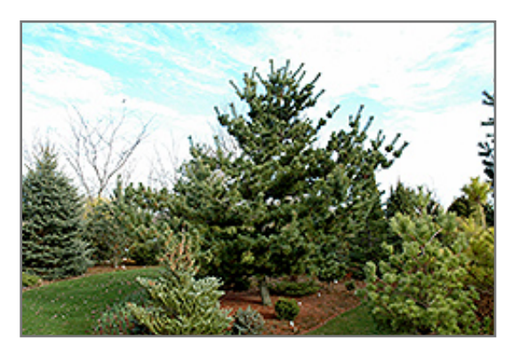
Tempelhof Japanese White Pine

830 W Liberty Dr. Liberty, MO 64068 816.781.0001