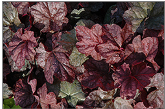
Beaujolais Hairy Alumroot foliage