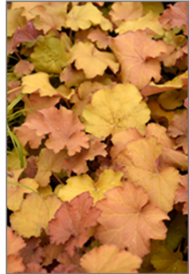
Caramel Coral Bells foliage

Caramel Coral Bells is recommended for the following landscape applications;