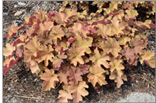
Caramel Coral Bells

Caramel Coral Bells will grow to be about 10 inches tall at maturity extending to 18 inches tall with the flowers, with a spread of 18 inches. When grown in masses or used as a bedding plant, individual plants should be spaced approximately 15 inches apart. Its foliage tends to remain low and dense right to the ground. It grows at a medium rate, and under ideal conditions can be expected to live for approximately 10 years. As an evergreen perennial, this plant will typically keep its form and foliage year-round.