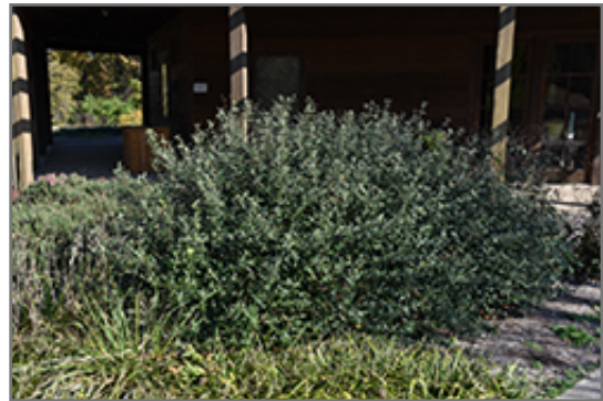
Prague Viburnum