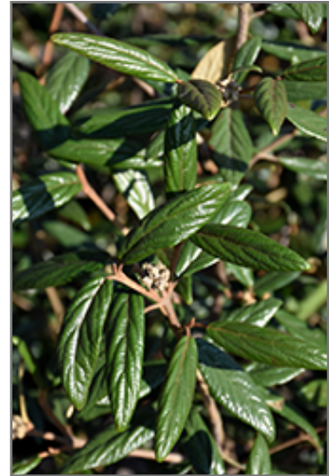
Prague Viburnum foliage

This shrub does best in full sun to partial shade. It prefers to grow in average to moist conditions, and shouldn't be allowed to dry out. It is not particular as to soil type or pH. It is highly tolerant of urban pollution and will even thrive in inner city environments. This particular variety is an interspecific hybrid.