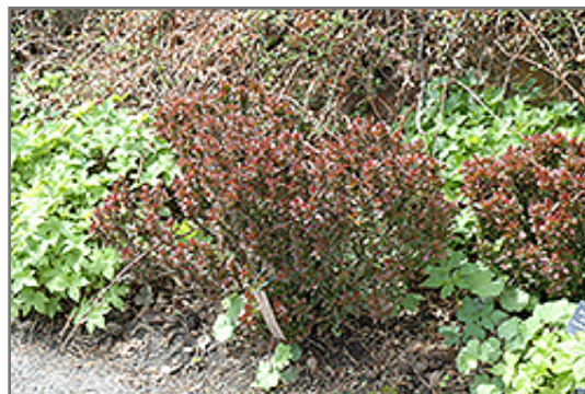
Bagatelle Japanese Barberry