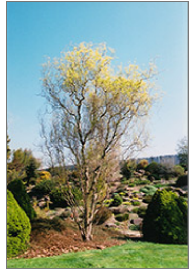
Dragon's Claw Willow in winter

Dragon's Claw Willow will grow to be about 30 feet tall at maturity, with a spread of 25 feet. It has a low canopy with a typical clearance of 2 feet from the ground, and should not be planted underneath power lines. It grows at a fast rate, and under ideal conditions can be expected to live for 40 years or more.