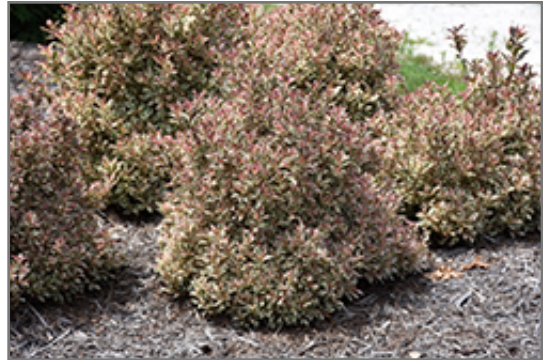
My Monet Weigela

My Monet Weigela makes a fine choice for the outdoor landscape, but it is also well-suited for use in outdoor pots and containers. It is often used as a 'filler' in the 'spiller-thriller-filler' container combination, providing a mass of flowers and foliage against which the thriller plants stand out. Note that when grown in a container, it may not perform exactly as indicated on the tag - this is to be expected. Also note that when growing plants in outdoor containers and baskets, they may require more frequent waterings than they would in the yard or garden.