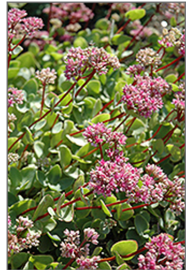
October Daphne flowers