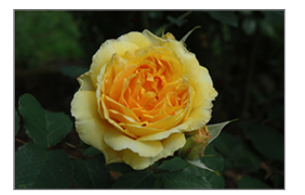
Molineux Rose flowers

8424 Farley St. Overland Park, KS 66212 913.642.6503