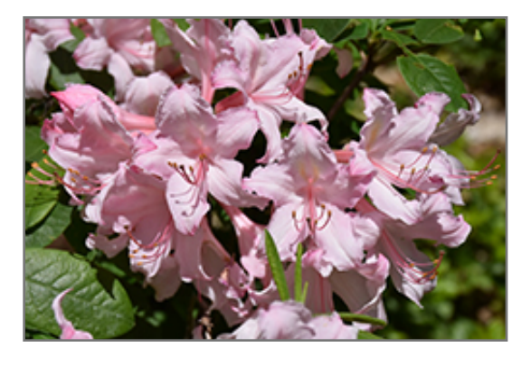
Candy Lights Azalea flowers

830 W Liberty Dr. Liberty, MO 64068 816.781.0001