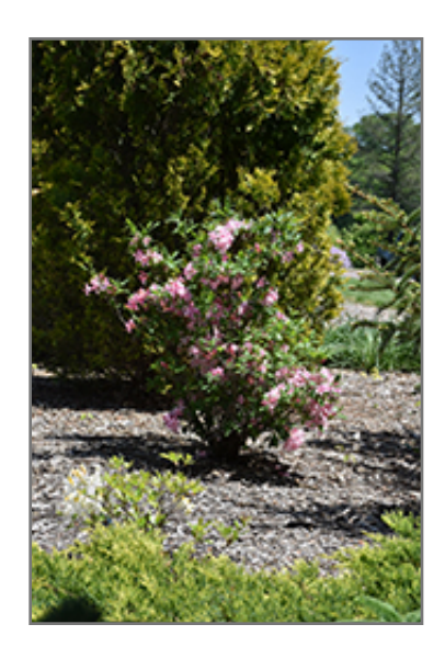
Candy Lights Azalea in bloom