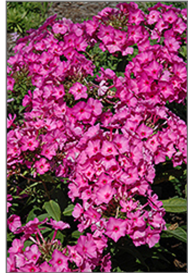
Flame Pink Garden Phlox flowers