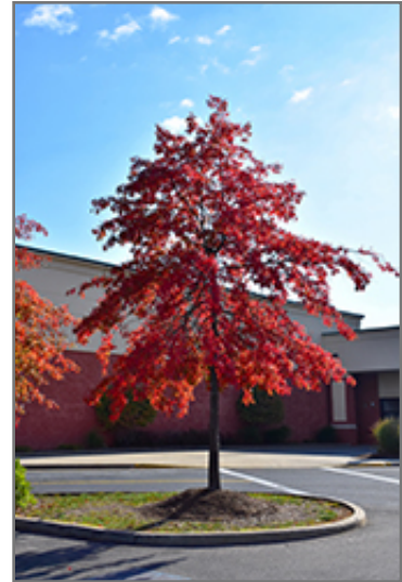
Pin Oak in fall