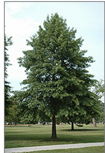
Pin Oak