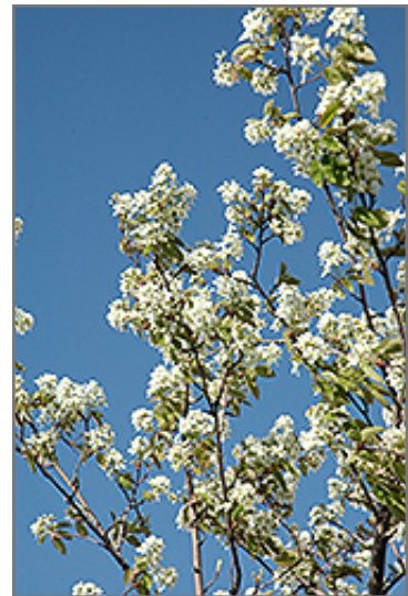
Allegheny Serviceberry flowers