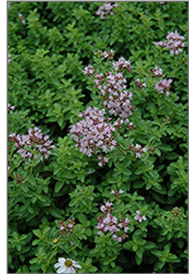
Dwarf Oregano flowers

Aside from its primary use as an edible, Dwarf Oregano is suitable for the following landscape applications;