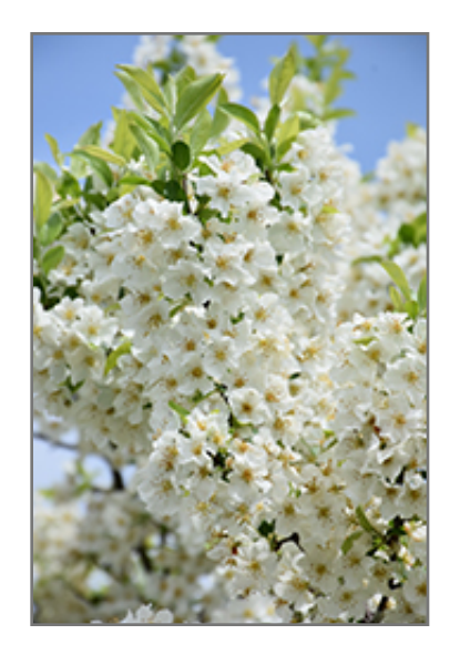
Lollipop Flowering Crab flowers

7036 Nieman Shawnee, KS 66203 913.631.6121