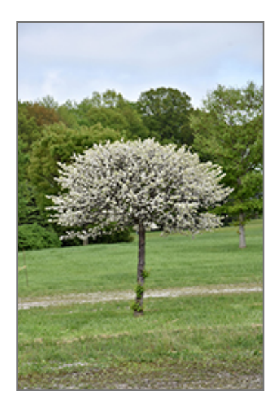
Lollipop Flowering Crab in bloom

This dwarf tree should only be grown in full sunlight. It prefers to grow in average to moist conditions, and shouldn't be allowed to dry out. It is not particular as to soil type or pH. It is highly tolerant of urban pollution and will even thrive in inner city environments. This particular variety is an interspecific hybrid.