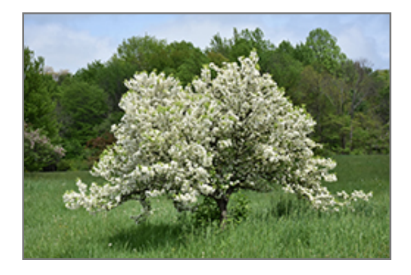
Lollipop Flowering Crab in bloom