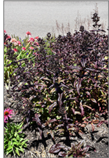
Dakota Burgundy Beard Tongue

Dakota Burgundy Beard Tongue is a fine choice for the garden, but it is also a good selection for planting in outdoor pots and containers. With its upright habit of growth, it is best suited for use as a 'thriller' in the 'spiller-thriller-filler' container combination; plant it near the center of the pot, surrounded by smaller plants and those that spill over the edges. Note that when growing plants in outdoor containers and baskets, they may require more frequent waterings than they would in the yard or garden.