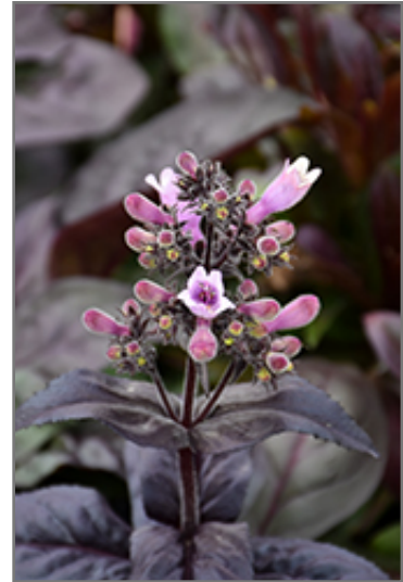
Dakota Burgundy Beard Tongue flowers

Dakota Burgundy Beard Tongue is an herbaceous perennial with an upright spreading habit of growth. Its medium texture blends into the garden, but can always be balanced by a couple of finer or coarser plants for an effective composition.