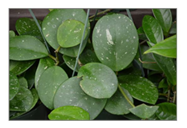
Hoya obovata foliage

830 W Liberty Dr. Liberty, MO 64068 816.781.0001