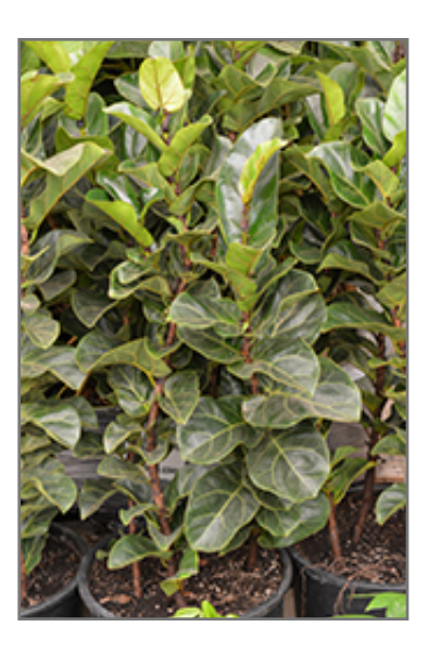
Little Sunshine Dwarf Fiddle Leaf Fig in full

When grown indoors, Little Sunshine Dwarf Fiddle Leaf Fig can be expected to grow to be about 5 feet tall at maturity, with a spread of 30 inches. It grows at a medium rate, and under ideal conditions can be expected to live for approximately 100 years. This houseplant will do well in a location that gets either direct or indirect sunlight, although it will usually require a more brightly-lit environment than what artificial indoor lighting alone can provide. It does best in average to evenly moist soil, but will not tolerate standing water. The surface of the soil shouldn't be allowed to dry out completely, and so you should expect to water this plant once and possibly even twice each week. Be aware that your particular watering schedule may vary depending on its location in the room, the pot size, plant size and other conditions; if in doubt, ask one of our experts in the store for advice. It will benefit from a regular feeding with a general-purpose fertilizer with every second or third watering. It is not particular as to soil type, but has a definite preference for acidic soil. Contact the store for specific recommendations on pre-mixed potting soil for this plant. Be warned that parts of this plant are known to be toxic to humans and animals, so special care should be exercised if growing it around children and pets.