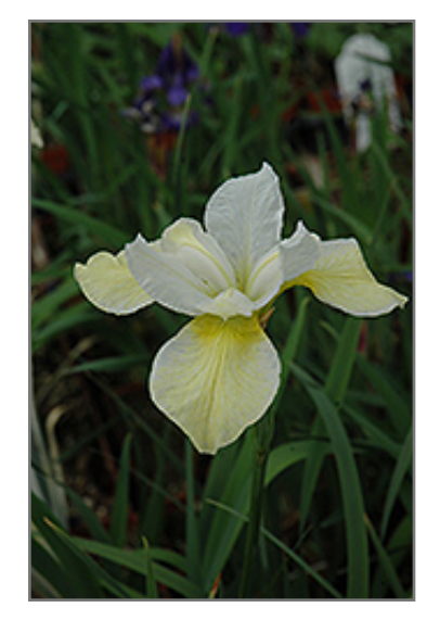
Butter And Sugar Siberian Iris flowers

830 W Liberty Dr. Liberty, MO 64068 816.781.0001