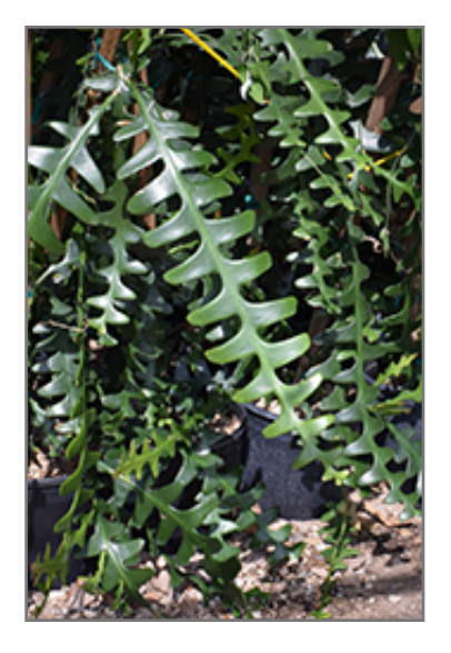
Fishbone Cactus foliage

830 W Liberty Dr. Liberty, MO 64068 816.781.0001