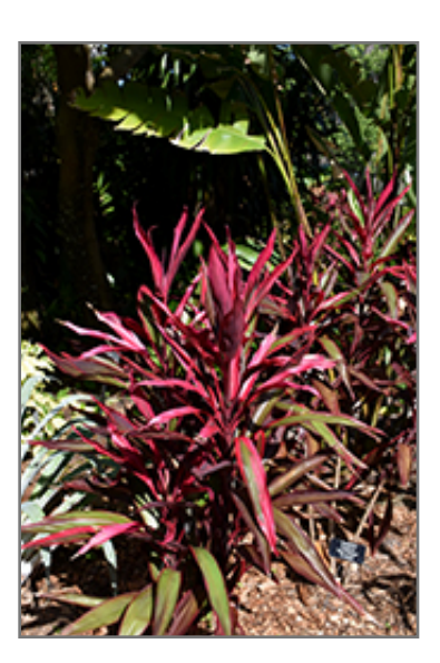
Red Pepper Hawaiian Ti Plant

When grown indoors, Red Pepper Hawaiian Ti Plant can be expected to grow to be about 6 feet tall at maturity, with a spread of 3 feet. It grows at a medium rate, and under ideal conditions can be expected to live for approximately 10 years. This houseplant will do well in a location that gets either direct or indirect sunlight, although it will usually require a more brightly-lit environment than what artificial indoor lighting alone can provide. It does best in average to evenly moist soil, but will not tolerate standing water. The surface of the soil shouldn't be allowed to dry out completely, and so you should expect to water this plant once and possibly even twice each week. Be aware that your particular watering schedule may vary depending on its location in the room, the pot size, plant size and other conditions; if in doubt, ask one of our experts in the store for advice. It will benefit from a regular feeding with a general-purpose fertilizer with every second or third watering. It is not particular as to soil type or pH; an average potting soil should work just fine.