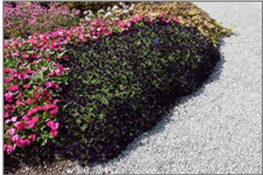
Supertunia Mini Vista Midnight Petunia in bloom

Supertunia Mini Vista Midnight Petunia will grow to be about 8 inches tall at maturity, with a spread of 24 inches. When grown in masses or used as a bedding plant, individual plants should be spaced approximately 20 inches apart. Its foliage tends to remain low and dense right to the ground. This fast-growing annual will normally live for one full growing season, needing replacement the following year.