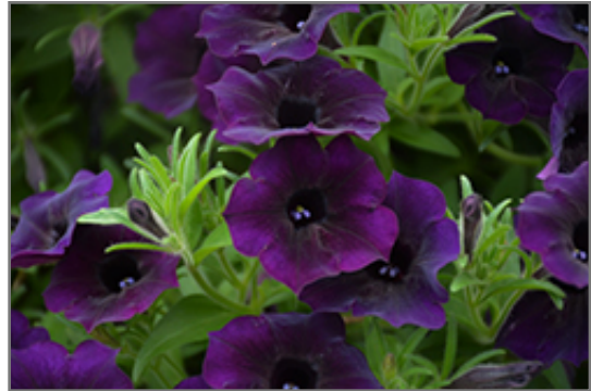
Supertunia Mini Vista Midnight Petunia flowers

This plant will require occasional maintenance and upkeep. Trim off the flower heads after they fade and die to encourage more blooms late into the season. It is a good choice for attracting butterflies and hummingbirds to your yard, but is not particularly attractive to deer who tend to leave it alone in favor of tastier treats. It has no significant negative characteristics.