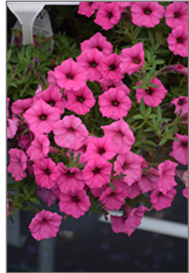
Supertunia Mini Vista Hot Pink Petunia flowers

Supertunia Mini Vista Hot Pink Petunia is recommended for the following landscape applications;