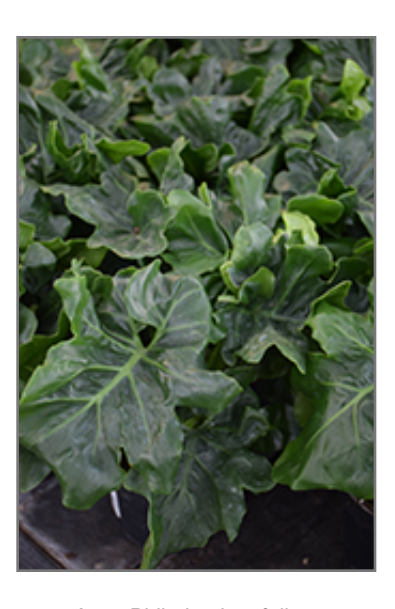
Atom Philodendron foliage

When grown indoors, Atom Philodendron can be expected to grow to be about 24 inches tall at maturity, with a spread of 24 inches. It grows at a medium rate, and under ideal conditions can be expected to live for approximately 10 years. This houseplant should only be grown away from direct sunlight or in a room with strong artificial light. It prefers to grow in average to moist soil. The surface of the soil shouldn't be allowed to dry out completely, and so you should expect to water this plant once and possibly even twice each week. Be aware that your particular watering schedule may vary depending on its location in the room, the pot size, plant size and other conditions; if in doubt, ask one of our experts in the store for advice. It will benefit from a regular feeding with a general-purpose fertilizer with every second or third watering. It is not particular as to soil type or pH; an average potting soil should work just fine. Be warned that parts of this plant are known to be toxic to humans and animals, so special care should be exercised if growing it around children and pets.