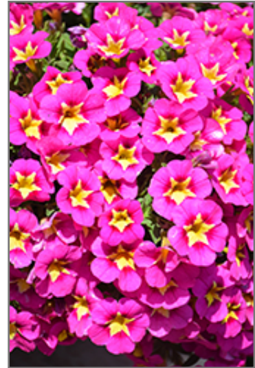
Bumble Bee Hot Pink Calibrachoa flowers

This plant will require occasional maintenance and upkeep. Trim off the flower heads after they fade and die to encourage more blooms late into the season. It is a good choice for attracting bees and hummingbirds to your yard, but is not particularly attractive to deer who tend to leave it alone in favor of tastier treats. It has no significant negative characteristics.