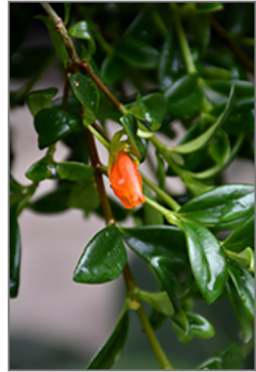
Goldfish Plant flowers

This is a dense herbaceous evergreen houseplant with a trailing habit of growth, eventually spilling over the edges of hanging baskets and containers. This plant can be pruned at any time to keep it looking its best.