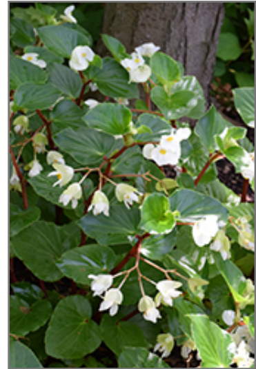
Megawatt White Green Leaf Begonia flowers