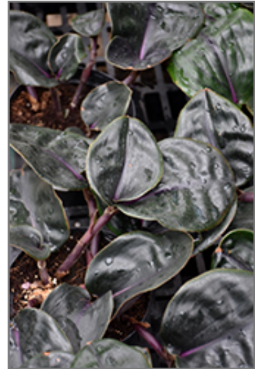
Geo Plant foliage

When grown indoors, Geo Plant can be expected to grow to be only 6 inches tall at maturity extending to 8 inches tall with the flowers, with a spread of 12 inches. It grows at a slow rate, and under ideal conditions can be expected to live for approximately 5 years. This houseplant performs well in both bright or indirect sunlight and strong artificial light, and can therefore be situated in almost any well-lit room or location. It prefers to grow in average to moist soil. The surface of the soil shouldn't be allowed to dry out completely, and so you should expect to water this plant once and possibly even twice each week. Be aware that your particular watering schedule may vary depending on its location in the room, the pot size, plant size and other conditions; if in doubt, ask one of our experts in the store for advice. It will benefit from a regular feeding with a general-purpose fertilizer with every second or third watering. It is not particular as to soil pH, but grows best in rich soil. Contact the store for specific recommendations on pre-mixed potting soil for this plant.