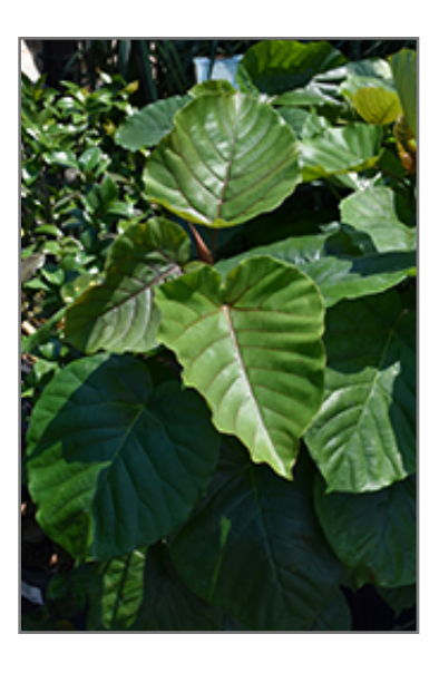
Lily Pads Umbellata Umbrella Fig Tree foliage

When grown indoors, Lily Pads Umbellata Umbrella Fig Tree can be expected to grow to be about 6 feet tall at maturity, with a spread of 4 feet. It grows at a medium rate, and under ideal conditions can be expected to live for approximately 20 years. This houseplant will do well in a location that gets either direct or indirect sunlight, although it will usually require a more brightly-lit environment than what artificial indoor lighting alone can provide. It does best in average to evenly moist soil, but will not tolerate standing water. The surface of the soil shouldn't be allowed to dry out completely, and so you should expect to water this plant once and possibly even twice each week. Be aware that your particular watering schedule may vary depending on its location in the room, the pot size, plant size and other conditions; if in doubt, ask one of our experts in the store for advice. It will benefit from a regular feeding with a general-purpose fertilizer with every second or third watering. It is not particular as to soil type or pH; an average potting soil should work just fine. Be warned that parts of this plant are known to be toxic to humans and animals, so special care should be exercised if growing it around children and pets.