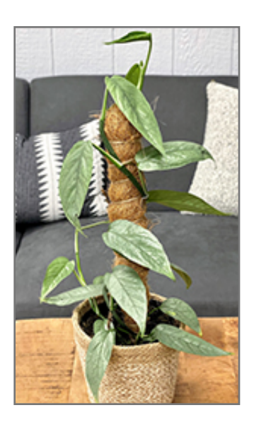
Beautifall Cebu Blue Pothos in full

When grown indoors, Beautifall Cebu Blue Pothos can be expected to grow to be about 9 feet tall at maturity, with a spread of 24 inches. It grows at a fast rate, and under ideal conditions can be expected to live for approximately 10 years. This houseplant will do well in a location that gets either direct or indirect sunlight, although it will usually require a more brightly-lit environment than what artificial indoor lighting alone can provide. It does best in average to evenly moist soil, but will not tolerate standing water. The surface of the soil shouldn't be allowed to dry out completely, and so you should expect to water this plant once and possibly even twice each week. Be aware that your particular watering schedule may vary depending on its location in the room, the pot size, plant size and other conditions; if in doubt, ask one of our experts in the store for advice. It will benefit from a regular feeding with a general-purpose fertilizer with every second or third watering. It is not particular as to soil type or pH; an average potting soil should work just fine. Be warned that parts of this plant are known to be toxic to humans and animals, so special care should be exercised if growing it around children and pets.