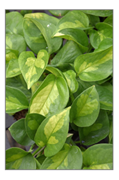
Global Green Pothos foliage

When grown indoors, Global Green Pothos can be expected to grow to be about 5 feet tall at maturity, with a spread of 24 inches. It grows at a fast rate, and under ideal conditions can be expected to live for approximately 10 years. This houseplant performs well in both bright or indirect sunlight and strong artificial light, and can therefore be situated in almost any well-lit room or location. It does best in average to evenly moist soil, but will not tolerate standing water. The surface of the soil shouldn't be allowed to dry out completely, and so you should expect to water this plant once and possibly even twice each week. Be aware that your particular watering schedule may vary depending on its location in the room, the pot size, plant size and other conditions; if in doubt, ask one of our experts in the store for advice. It is not particular as to soil type or pH; an average potting soil should work just fine. Be warned that parts of this plant are known to be toxic to humans and animals, so special care should be exercised if growing it around children and pets.