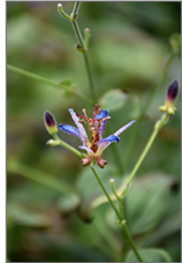
Dark Beauty Toad Lily flowers

This exceptional variety is noted for attractive purple spotted orchid-like flowers with yellow throats, appearing in late summer; long stems with slightly hairy, dark green foliage; deserves a spot where it can be seen up close; an excellent cut flower