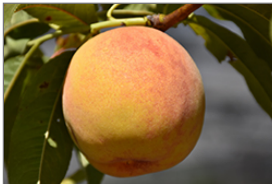
Reliance Peach fruit

Reliance Peach is clothed in stunning clusters of fragrant pink flowers along the branches in early spring, which emerge from distinctive rose flower buds before the leaves. It has dark green deciduous foliage. The narrow leaves turn yellow in fall. The fruits are showy yellow drupes with a red blush, which are carried in abundance in mid summer. The fruit can be messy if allowed to drop on the lawn or walkways, and may require occasional clean-up.