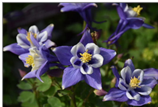
Earlybird Blue and White Columbine flowers