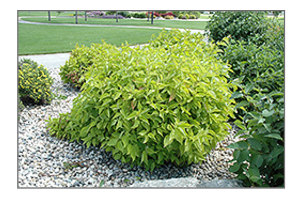
Prairie Fire Dogwood

Prairie Fire Dogwood is a multi-stemmed deciduous shrub with a more or less rounded form. Its average texture blends into the landscape, but can be balanced by one or two finer or coarser trees or shrubs for an effective composition.