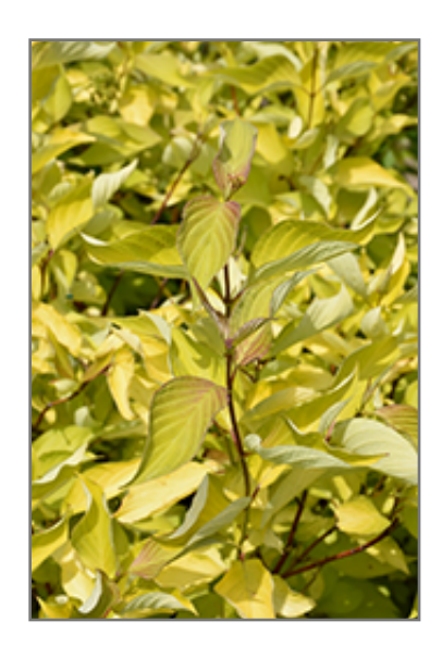
Prairie Fire Dogwood foliage

This is a relatively low maintenance shrub, and can be pruned at anytime. It has no significant negative characteristics.