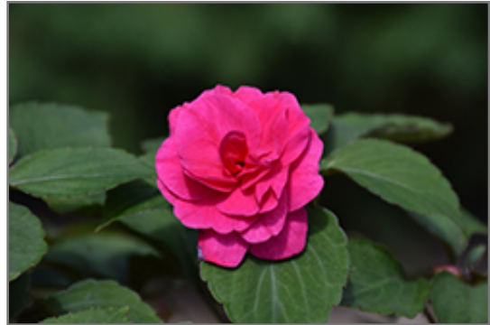
Glimmer Hot Pink Double Impatiens flowers