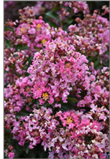
Barista Peppermint Mocha Crapemyrtle flowers

Barista Peppermint Mocha Crapemyrtle is recommended for the following landscape applications;